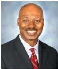
Medical Center, Loma Linda, California Web CV